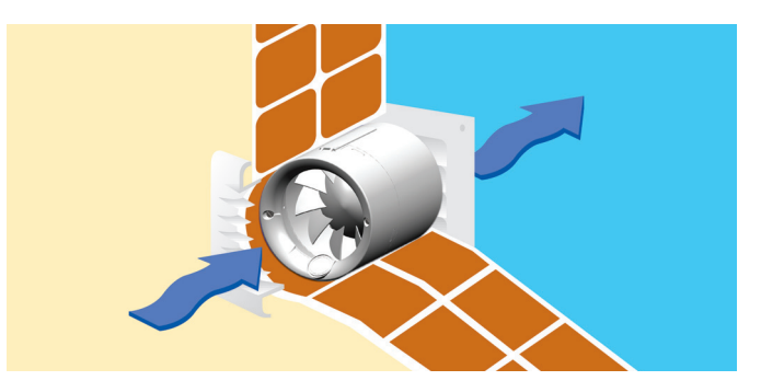
Installation inside the wall to exchange heat between adjoining rooms and exhaust air from the spaces.