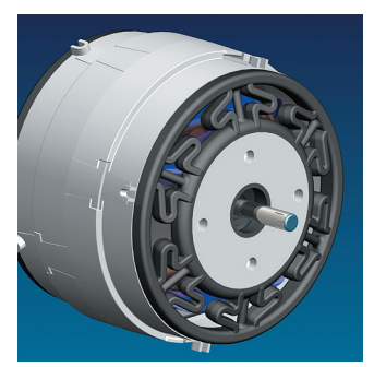
Silent-blocks To absorb vibrations and reduce noise transmission.

Single phase motor 230V-50Hz with ball bearings. The fan is protected against electric shock Class II and has degree of protection IP 44 . Suitable for operation within temperatures up to 40°C. Electrical Wiring Diagrams: Fig. 15, p. 928.